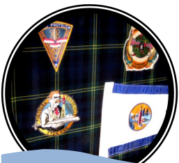
10. Polaris Tartan

10. This tartan was designed and named for the Polaris missile and reflects the many years the US Navy had a submarine base at _____ Scotland.