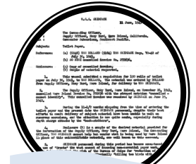
9. USS Skipjack Memo

8. The crews of the _____ and the _____ played the world's first polar _____ game.