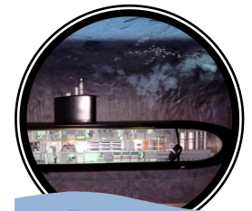
11. City Beneath the Sea

10. This tartan was designed and named for the Polaris missile and reflects the many years the US Navy had a submarine base at _____ Scotland.