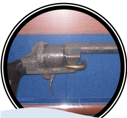
4. Paul Foster Revolver

2. Developed in the year _____ the Whitehead Torpedo was one of the earliest to use _____ to control its aim.