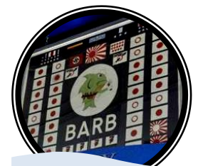
5. USS Barb Battle Flag