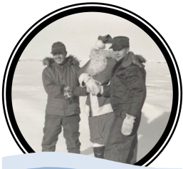
8. Greetings From the North Pole

7. This elevator was especially constructed for President _____'s visit aboard SSBN 610 due to his back injury.