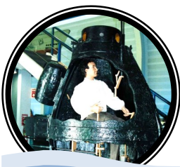
6. Bushnell's Turtle