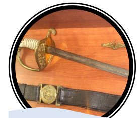
3. Howard Gilmore Dress Sword