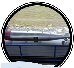
2. Whitehead Torpedo

Welcome to the Submarine Force Museum. This scavenger hunt is meant to guide you towards some of the unique items in our collection. Discovering more about the history and heritage of the U.S. Navy Submarine Force in the process. For each object fill in the blank with information that can be found in our exhibits.